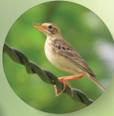
Paddyfield Pipit Anthus Rufulus

A white bird often seen near grazing animals, catching insects stirred from the ground. In breeding season, it grows orange feathers on its head and chest.