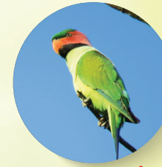
Long-Tailed Parakeet Psittacula Longicauda

A cheerful green parrot with a long tail. Travels in noisy flocks and loves feeding on fruits and blossoms.