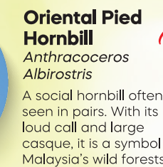
Oriental Pied Hornbill Anthracoseros Albirostris

A cheerful green parrot with a long tail. Travels in noisy flocks and loves feeding on fruits and blossoms.