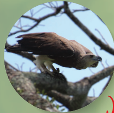
Grey-Headed Fish Eagle Haliaeetus Ichthyaeetus

A small brown bird with streaked upperparts, often seen walking or running on grass. It feeds on insects and blends easily into its habitat.