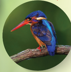
Blue-Eared Kingfisher Alcedo Meninting

A shiny black-green bird with bright red eyes. Moves in large flocks and fills the sky with lively chatter.