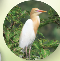
Eastern Cattle Egret Bubulcus Coromandus

A shy, fast-diving hunter found along clean streams. Its bright blue feathers shine like a jewel in the forest shade.